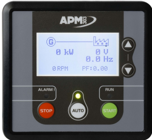
APM303, comprehensive and simple

The APM303 is a versatile unit which can be operated in manual or automatic mode. It offers the following features: Measurements: phase-to-neutral and phase-to-phase voltages, fuel level (In option : active power currents, effective power, power factors, Kw/h energy meter, oil pressure and coolant temperature levels) Supervision: Modbus RTU communication on RS485 Reports: (In option : 2 configurable reports) Safety features: Overspeed, oil pressure, coolant temperatures, minimum and maximum voltage, minimum and maximum frequency (Maximum active power P<66kVA) Traceability: Stack of 12 stored events For further information, please refer to the data sheet for the APM303.