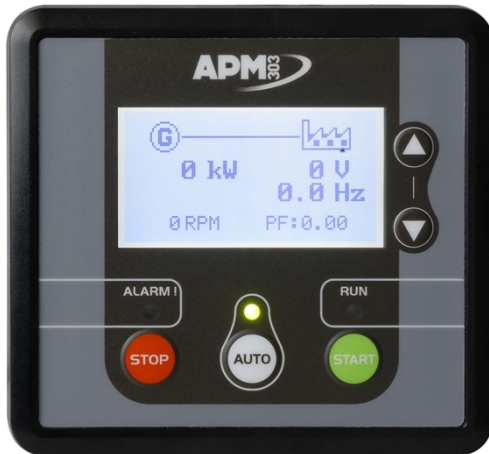
APM303, comprehensive and simple

The APM303 is a versatile unit which can be operated in manual or automatic mode. It offers the following features: Measurements: phase-to-neutral and phase-to-phase voltages, fuel level (In option : active power currents, effective power, power factors, Kw/h energy meter, oil pressure and coolant temperature levels) Supervision: Modbus RTU communication on RS485 Reports: (In option : 2 configurable reports) Safety features: Overspeed, oil pressure, coolant temperatures, minimum and maximum voltage, minimum and maximum frequency (Maximum active power P<66kVA) Traceability: Stack of 12 stored events For further information, please refer to the data sheet for the APM303.